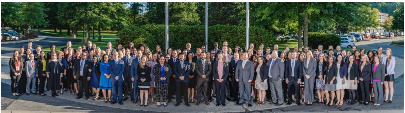
Defense Civilian Emerging Leader Program, Cohort 10, taken on September 13, 2019, Executive Management Training Center in Southbridge, MA.

Strategy 1.3: Improve Recruitment and Hiring