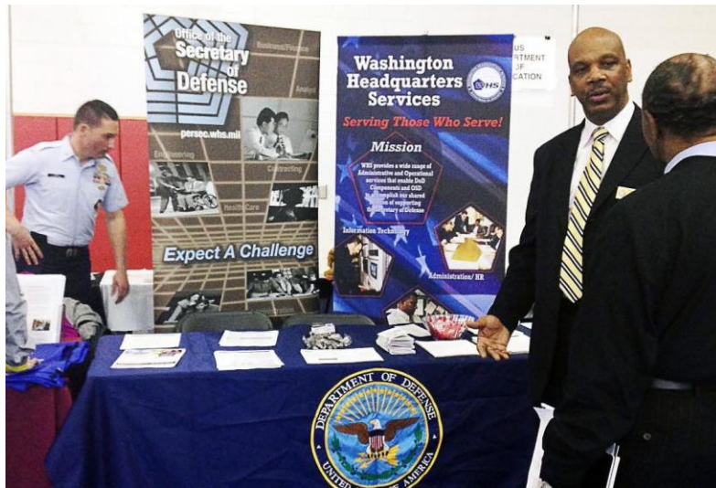
Washington Headquarters Services' Diversity, Disability and Recruitment Division at Corporate Gray Job Fair, April 20, 2019, Army Navy Country Club, Arlington, VA.