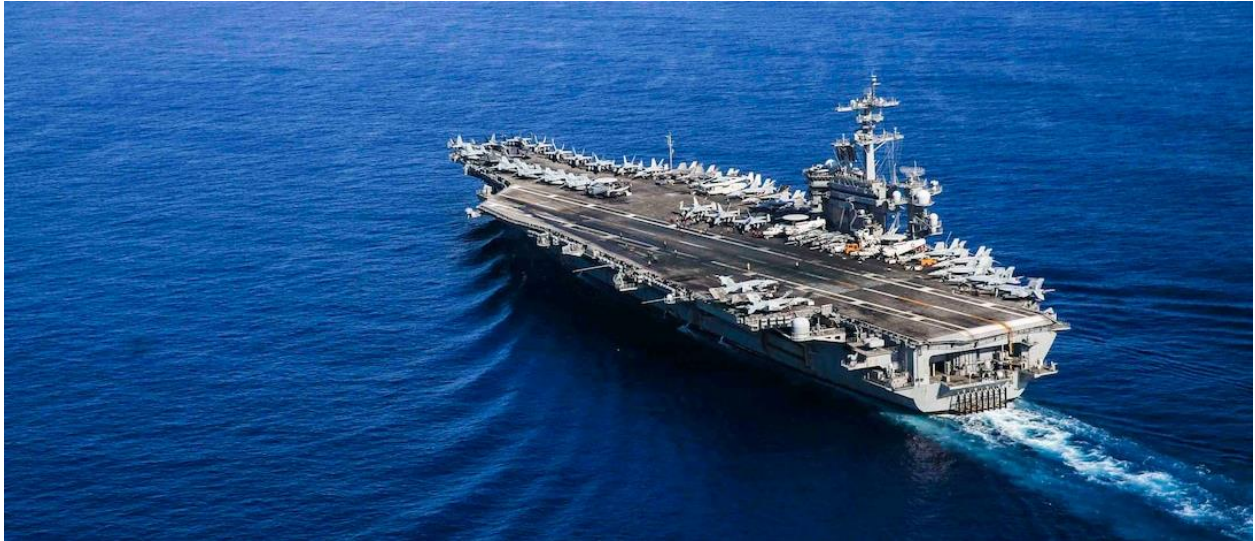
USS Abraham Lincoln transits the South China Sea, April 1, 2022.