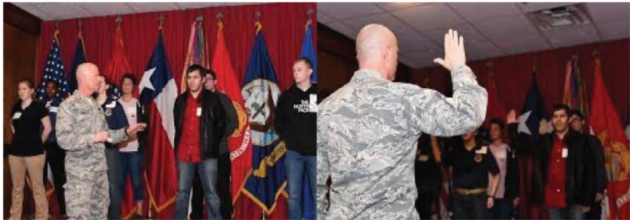
Recruits prepare to ship out after swear-in ceremony, Shreveport, LA, March 1, 2018.